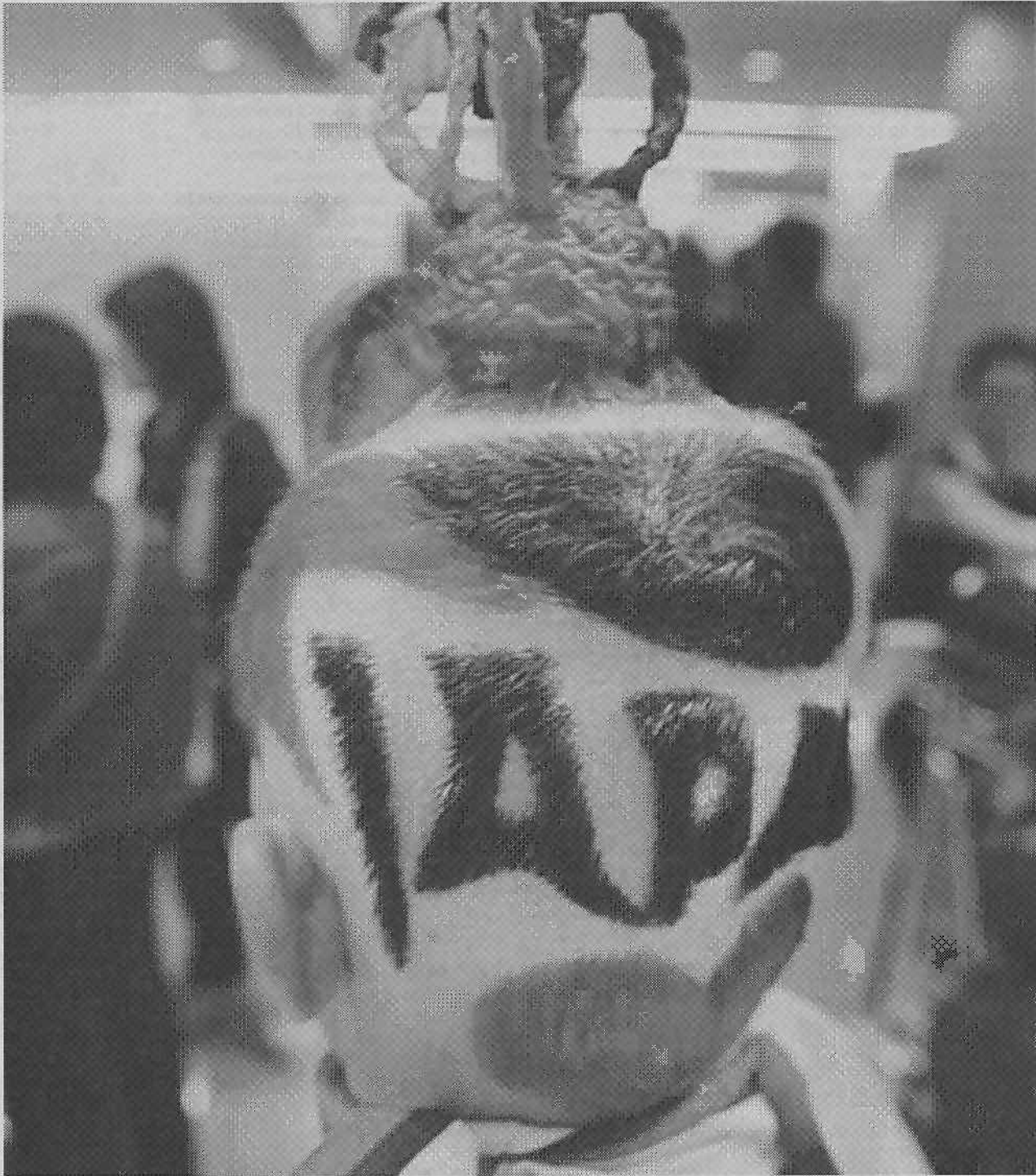
NON-JAPANESE STUDENTS with naturally lighter or curlier hair are being singled out under Japanese school rules supposedly aimed at curbing unnatural or nonconformist hairdos.

"In principle we say, 'Don't mess with your hair,'" the teacher said. "Having them dye